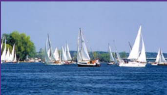
Excellent leisure possibilities in the region