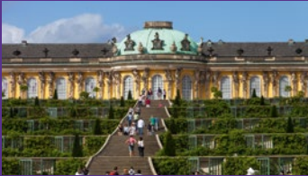
Schloss Sanssouci in Potsdam