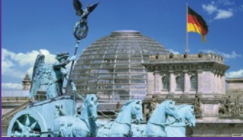
Quadriga in front of the Reichstag dome